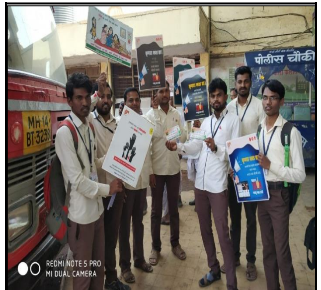
Students showing poster of Voter awareness