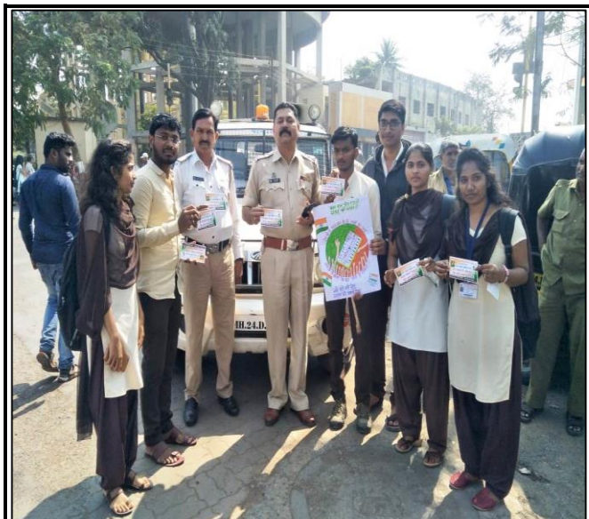
Students with Latur police showing posters of Voter Awareness