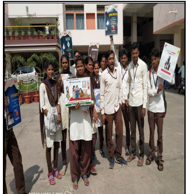
Students while showing poster in Voter Awareness Rally